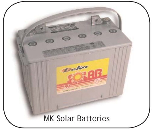
MK Solar Batteries

The Deka Solar Series of valve-regulated, gelled-electrolyte batteries are designed to offer reliable power for renewable energy applications where frequent deep cycles are required and minimum maintenance is desired. These batteries are sealed, but will vent at a pressure of 2 psi while being charged. Therefore, they require a ventilated enclosure to prevent gas build up. Maximum charging voltage should be at least 13.8 volts, but no more than 14.1 volts at 68°F. Two year warranty (One full and one pro-rated). We recommend these batteries for small to medium sized PV systems, from recreational vehicles to remote telecommunication sites.