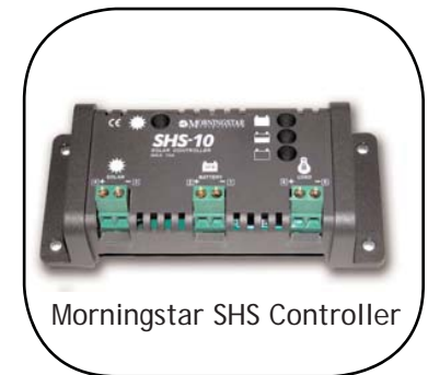
Morningstar SHS Controller