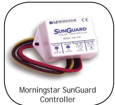
Morningstar SunGuard Controller