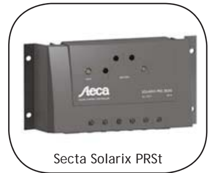
Secta Solarix PRSt

The simplicity and high performance of the Steca Solarix PRS solar charge controller makes it particularly appealing. At the same time, it offers a modern design and a convenient display, all at an extremely attractive price. Several LEDs in various colours emulate a tank display, which gives information on the battery's state of charge. Here, Steca's latest algorithms are employed, resulting in optimal battery maintenance. The Solarix PRS charge controllers are equipped with an electronic fuse, thus making optimal protection possible. They operate on the serial principle, and separate the solar module from the battery in order to protect it against overcharging. For larger projects, the charge controllers can also be equipped with special functions. These include a night light function, a selectable charging plateau and deep-discharge protection voltages. Two year warranty.