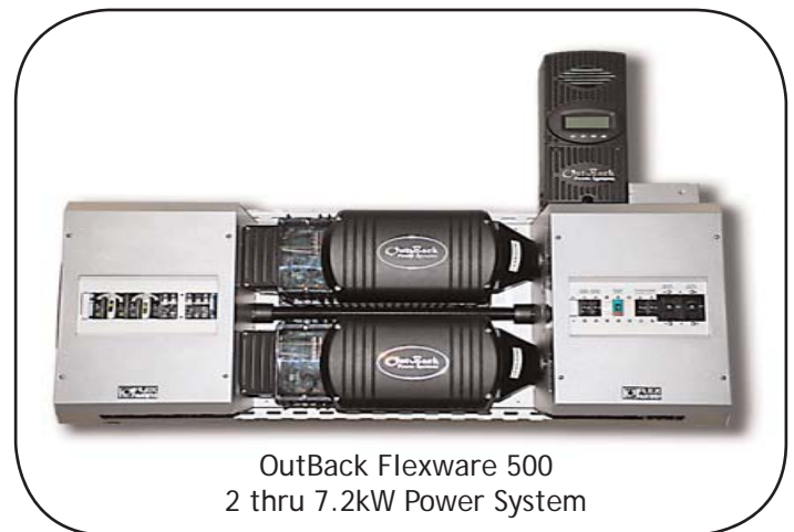
OutBack Flexware 500 2 thru 7.2kW Power System