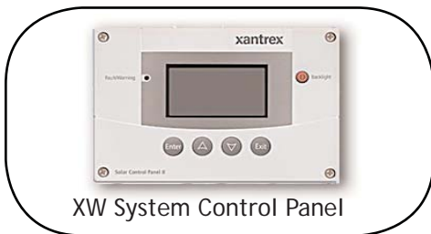
XW System Control Panel

The XW SCP is a Xanbus™-enabled device featuring a graphical, backlit LCD screen that displays system configuration and diagnostic information for all devices connected to the network. When installed as an XW System accessory, the XW SCP eliminates the need for separate control panels for each device and gives a single point of control to set up and monitor an entire XW Power System. 5 year warranty. 6" x 4" x 1 9/16" (152x103x40mm) 11lb