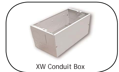
XW Conduit Box