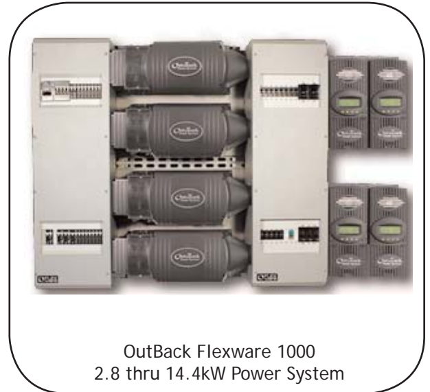
OutBack Flexware 1000 2.8 thru 14.4kW Power System

The OutBack Flexware 250-500 is a compact power system for one or two FX series inverter/chargers, up to three MX60 MPPT charge controllers, a MATE system controller and all the associated AC and DC components of a renewable energy power conversion system.