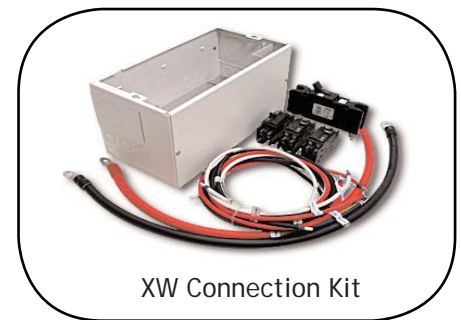
XW Connection Kit

Interfaces with: XW4024, XW4548, XW6048 Inverter Chargers, XW Power Distribution Panel