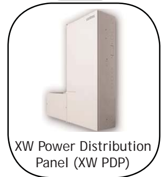
XW Power Distribution Panel (XW PDP)

The XW Power Distribution Panel with conduit box is factory-wired and labeled to support a code-compliant single-inverter installation. The XW PDP can be configured to mount on either side of the inverter/charger. Internal wiring and breakers can be added to expand the XW System with up to three inverters, four charge controllers, or other equipment to support larger systems, including three-phase. Mounting plate and XW conduit box is supplied with each XW PDP.