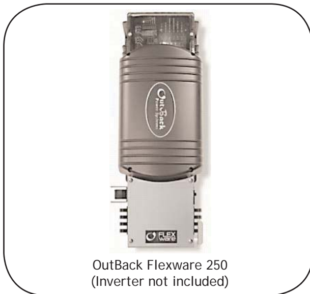
OutBack Flexware 250 (Inverter not included)

CALL 1-800-544-6466 AND ASK FOR MORE INFORMATION ON HOW TO ORDER.