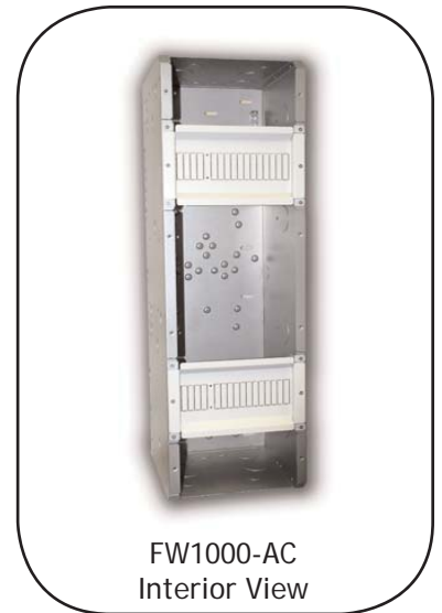
FW1000-AC Interior View