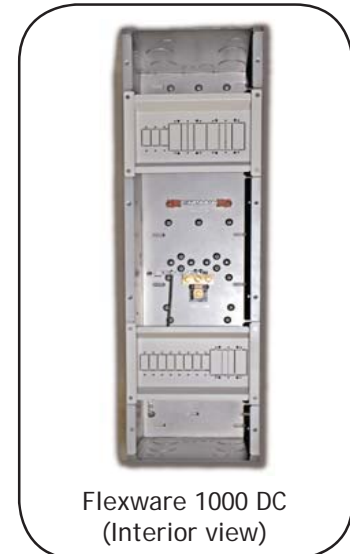
Flexware 1000 DC (Interior view)